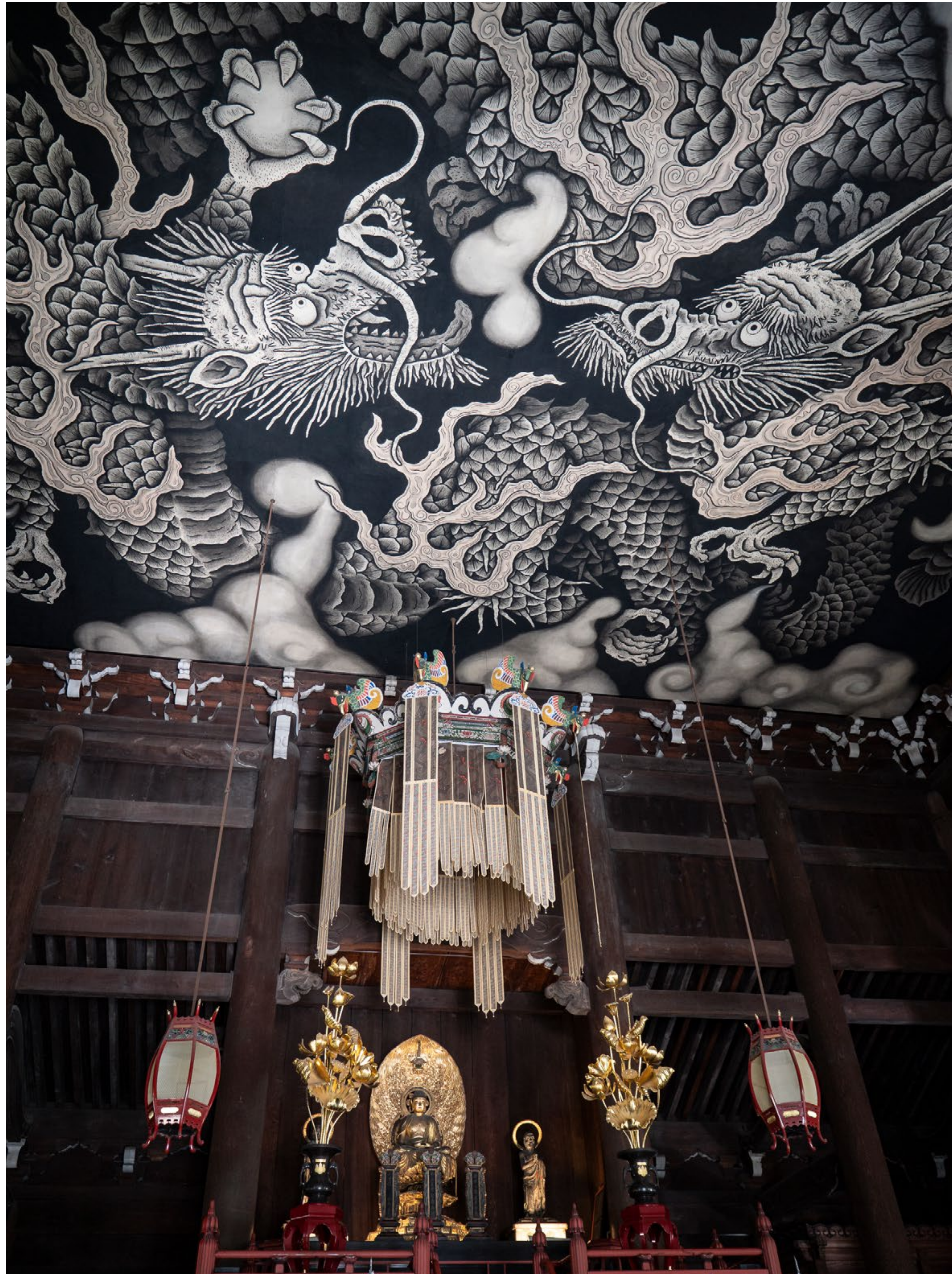
China and Japan