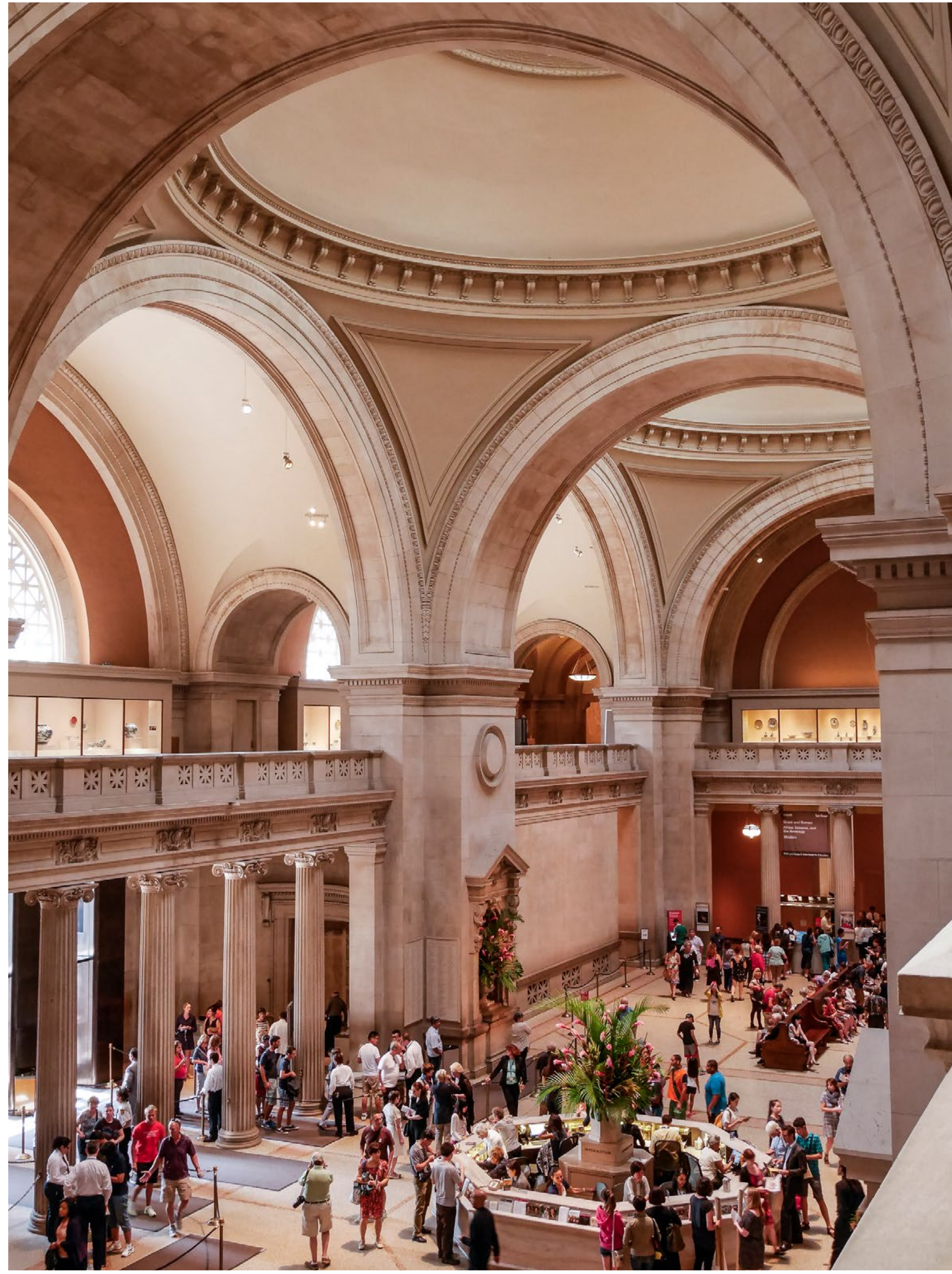
The New York Metropolitan Museum of Art